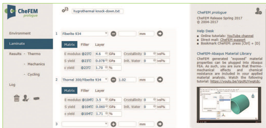
Fig. 1: The CheFEM user interface, with unexposed pristine Fiberite 934 defined in layer 1, and exposed filled Fiberite 934 defined in layer 2

CheFEM's output is primarily divided into a thermodynamic view and a mechanical view. The thermodynamic results for layer 2 are shown in Figure